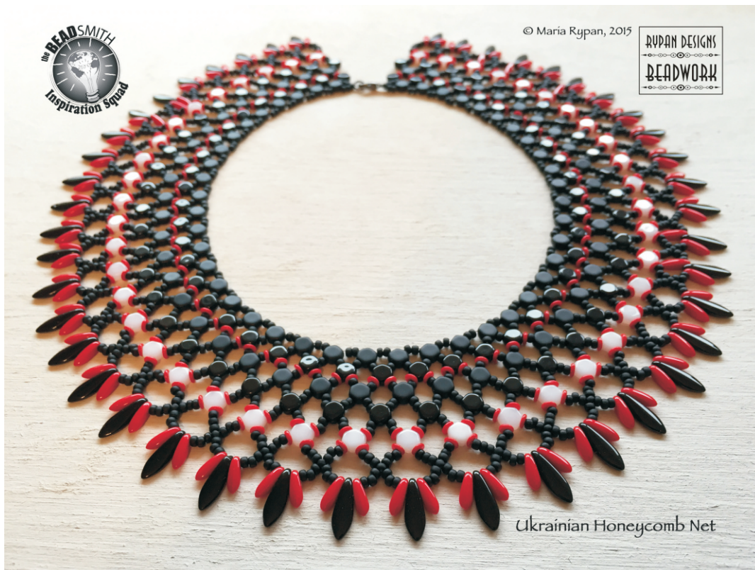
Ukrainian Honeycomb Net